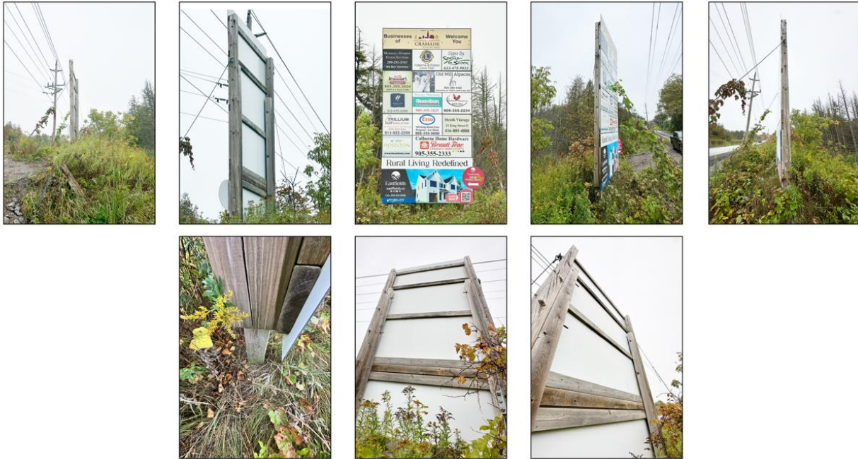
Figure 1: Existing Condition of the Sign

Updated messaging would replace the current advertising program focused on individual businesses. A new program is proposed to be designed that would promote broader economic interests within Township.