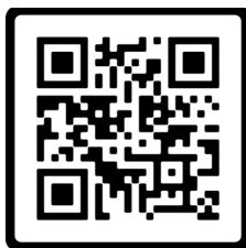
ONLINE PLEDGE FORM